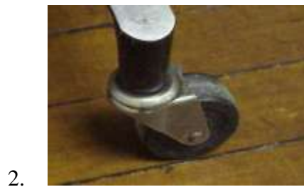
wheel and axel